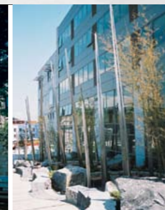
Government Offices, Waterford