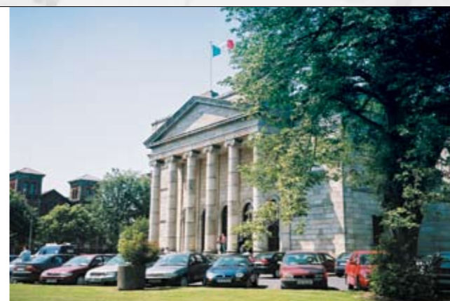
Waterford Court House - less than one minute walk from Maritana Gate

Created and designed to meet the demand of tomorrow's business world, the development has the flexibility to cater for a wide range of office users. Maximising this impressive parkside location, the developers and architects have created a truly unique high-quality environment that will have a broad appeal right across the business spectrum.