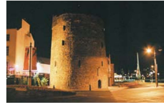
Reginald's Tower, Merchants Quay

Encapsulating the richness of Waterford's historic past and embracing the city's future as a National Gateway, Maritana Gate is a 76,000 sq. ft. Office Development destined to become the prime Business and Financial Services Centre for the South East.