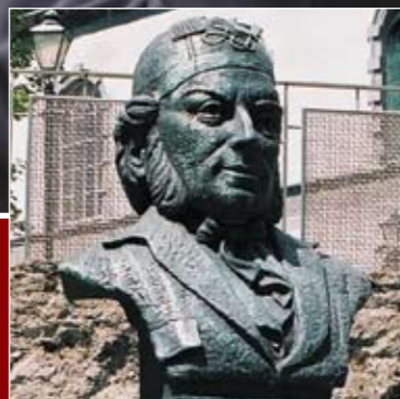
William Vincent Wallace