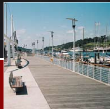
William Vincent Wallace Plaza overlooking the Marina